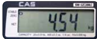
▲ Kg: SW & SW-Z