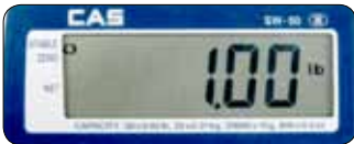
▲ Lb: SW & SW-Z