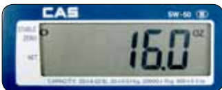
▲ Oz: SW only