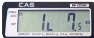
▲ Lb:oz decimal: SW-Z only