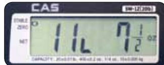
▲ Lb:oz fraction: SW-Z only