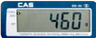
▲ Grams: SW only